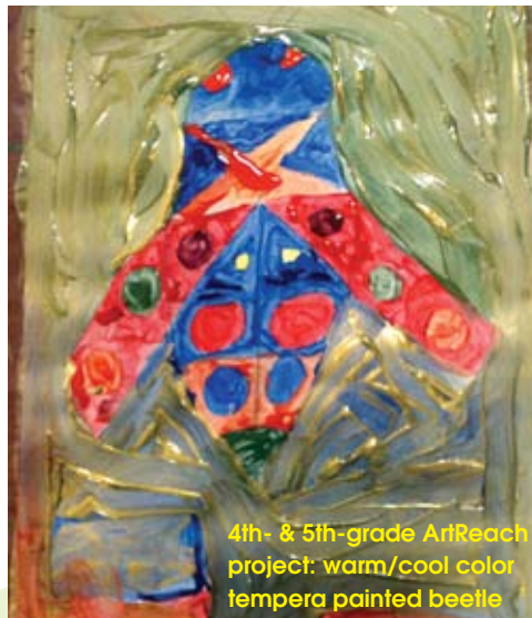
4th- & 5th-grade ArtReach project: warm/cool color tempera painted beetle