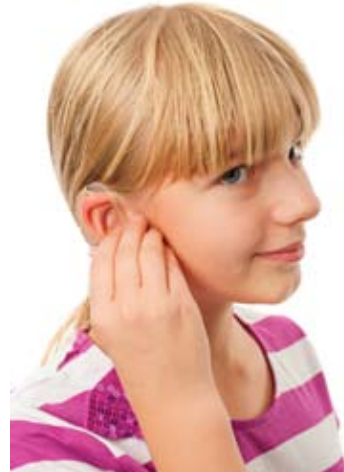
TVEF now helps subsidize hearing screening and hearing aids as an expansion of the “Eyeglasses for Children in Need” program.

We are truly blessed to live in a community that places a tremendous value on the education of its youth. Your allegiance to continuing educational excellence and outstanding student achievement has been overwhelming. As Teton Valley Education Foundation looks to the future, our goals are simple and